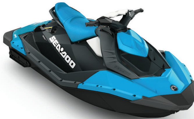
Blueberry coloration shown

In a class by itself, the Sea-Doo SPARK watercraft is playful and easy to ride, so everyone in your family will have a blast. Plus, you can choose from five attention-grabbing colors and numerous customization options and accessories.