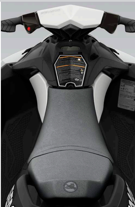
SLIM SEAT Freedom of movement