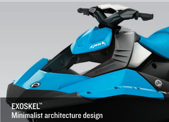
EXOSKEL™ Minimalist architecture design