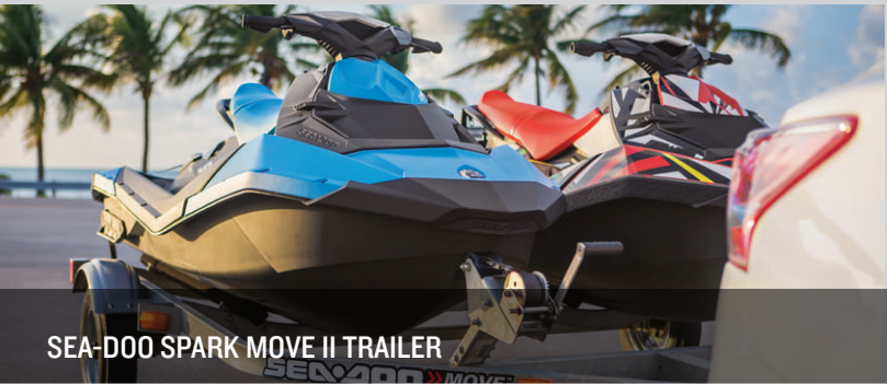
SEA-DOO SPARK MOVE II TRAILER