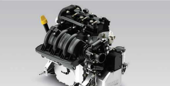
ROTAX 900 ACE ECO friendly