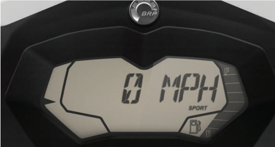
iTC™ Sport (HO engine) / Touring mode