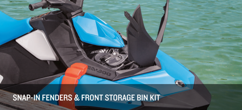
SNAP-IN FENDERS & FRONT STORAGE BIN KIT