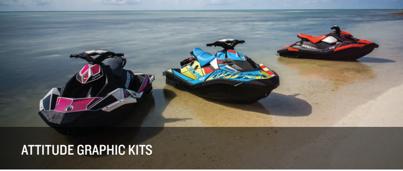
ATTITUDE GRAPHIC KITS