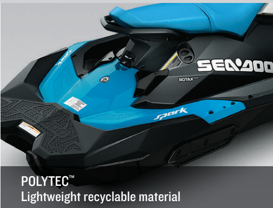
POLYTEC™ Lightweight recyclable material