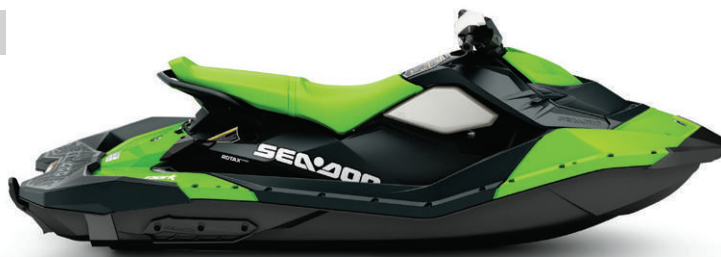
SPARK 3up Key Lime coloration and optional iBR & Convenience Package Plus shown