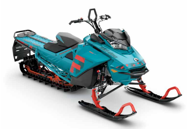
FREERIDE™ 154 850 E-TEC® shown